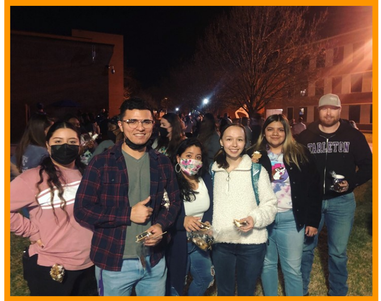
Members from TSU's ASCE student chapter at their s'mores homecoming social.

We are looking forward to hearing from UTA's ASCE student chapter and learning about their recent progress!