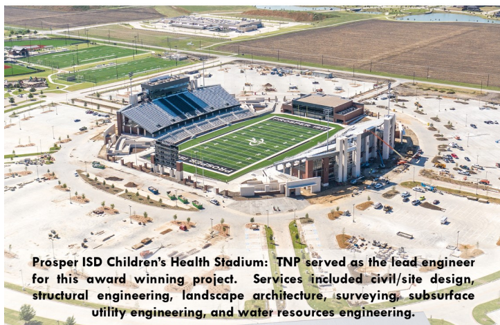
Prosper ISD Children's Health Stadium: TNP served as the lead engineer for this award winning project. Services included civil/site design, structural engineering, landscape architecture, surveying, subsurface utility engineering, and water resources engineering.