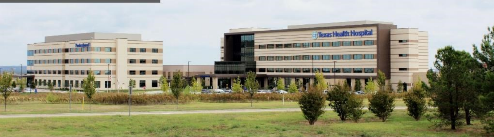
Approximate 38-Acre site for 191,600 sq-ft hospital, helipad, and 80,000 sq-ft Medical Office Building to support the hospital.