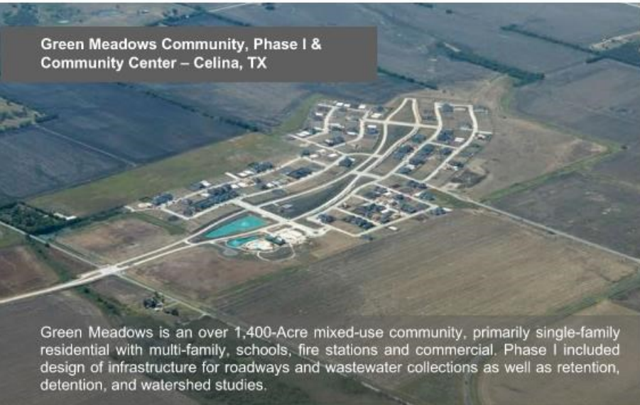
Green Meadows Community, Phase I & Community Center – Celina, TX

BEST COMPANIES TO WORK FOR IN FORT WORTH 2021